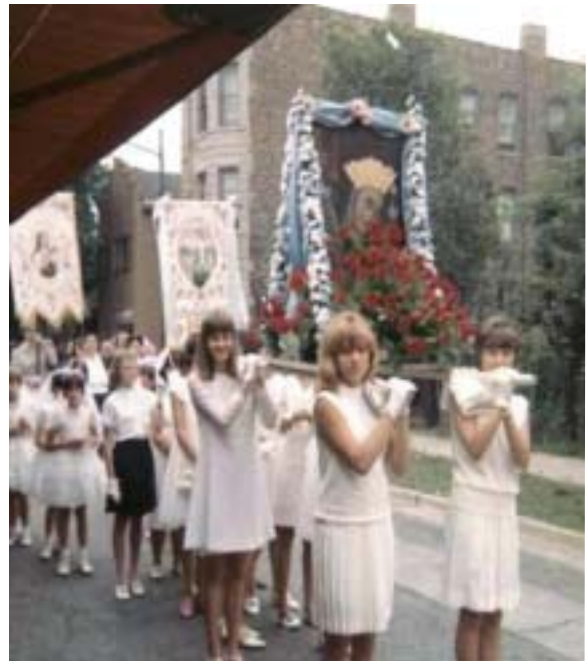
Velika Gospa in the 1960s

Početak prošlog stoljeća, Hrvati su se počeli naseljavati u Chicagu. Do 1910. njihov se broj već bio popeo na gotovo 5000. Većina novih doseljenika bila je iz Dalmacije, mnogi iz sinjske krajine. God. 1906. jedna grupa tih doseljenika se skupila i utemeljila Dalmatinsko obiteljsko društvo čudotvorne Gospe Sinjske. Za samo nekoliko godina broj se članova popeo na preko 600.