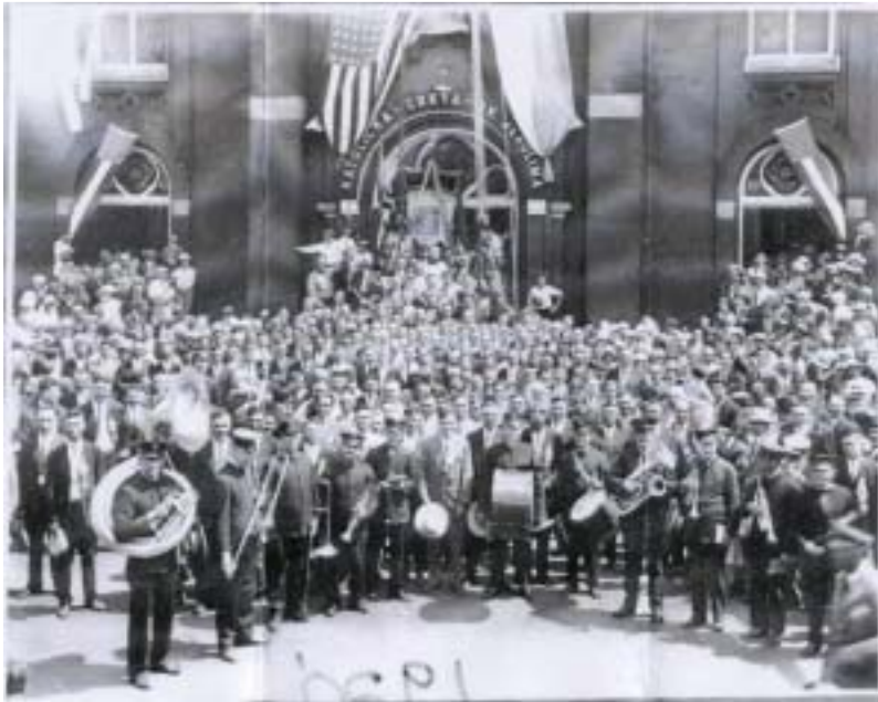
Velika Gospa in the 1920s

Crkva svetog Ivana Nepomuka, na uglu 25. i Princeton ulice, dopustila je Hrvatima slaviti velike katoličke blagdane. Tako su 1906. Hrvati Chicaga kao zajednica po prvi puta proslavili Veliku Gospu. Nastavili su tako do 1912. kada su utemeljili svoju, to jest hrvatsku župu svetog Jeronima. Od tada, pa do današnjeg dana, Hrvati Chicaga slave i javno štiju svoju Nebesku Majku, Bezgrešnu Djevicu Mariju.