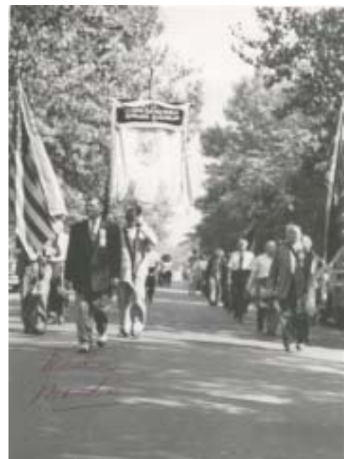
Velika Gospa in the 1930s

For 9 days prior to the feast, parishioners attend a novena to honor Our Lady of Sinj. The culmination of the novena comes on the 15th. In this way, the parishioners thank Mary for all the graces they have received through her intercession to her Divine Son. This unique novena is the source of the spiritual strength that the parishioners of St. Jerome draw from Velika Gospa. Today's Velika Gospa is not so different from the original one. The focal point remains the ornately decorated picture of Our Lady of Sinj and the religious devotion to her. St. Jerome's celebration of Velika Gospa is the largest such Croatian celebration on the North American continent. It is a call to spiritual renewal and pride in one's national heritage.