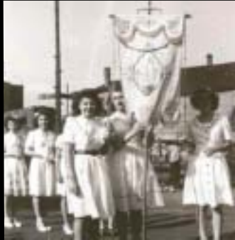
Velika Gospa in the 1940s

In 1906, Chicago's Bridgeport community had a Croatian population numbering almost 5,000. The majority came from Dalmatia. They all had a great devotion to Our Lady of Sinj and thus formed the Dalmatian Family Society of Our Lady of Sinj.