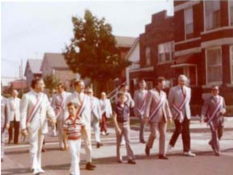
Velika Gospa in the 1970s

Around the early 1900s, Croatian immigrants began settling in the Bridgeport area. By 1910, they numbered almost 5,000. Most of the new arrivals were from Dalmatia, many from the area close to the town of Sinj. In 1906, a small group of men gathered and formed a fraternal society for social and cultural purposes. The name was The Dalmatian Family Society of the Miraculous Lady of Sinj. Within a few years, the society's membership grew to over 600.