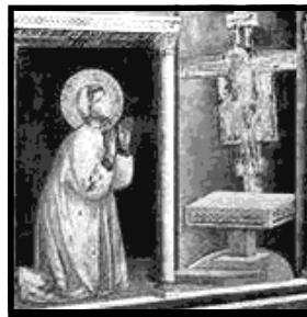
Francis & the Cross

This weekend, and especially on Monday, we celebrate a great man of Faith, St. Francis of Assisi. Since St. Jerome's founding in 1912, followers of