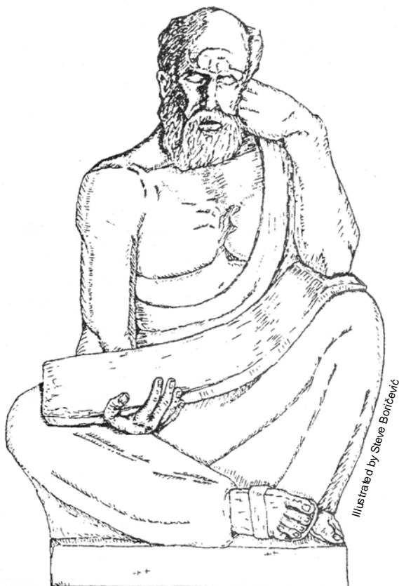
St. Jerome by Ivan Meštrović

St. Jerome Croatian Catholic Parish Hrvatska katolička župa sv. Jeronima