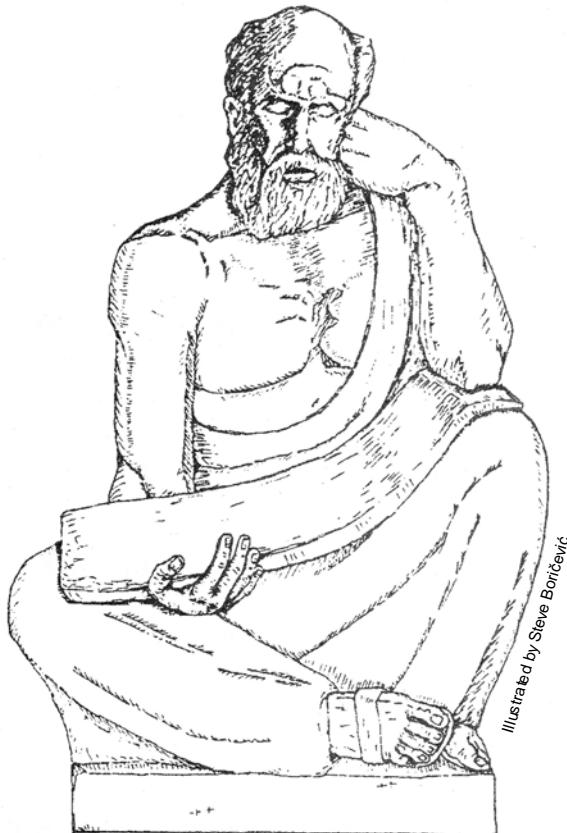
St. Jerome by Ivan Meštrović

St. Jerome Croatian Catholic Parish Hrvatska katolička župa sv. Jeronima