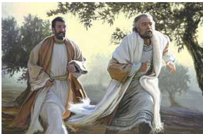
Apostles John and Peter running to the grave of Jesus.

Easter is a day of celebration because it represents the fulfillment of our faith. St. Paul wrote that, unless Christ rose from the dead, our faith is in vain (1 Corinthians 15:17). Through his death, Christ saved mankind from bondage to sin, and He destroyed the hold that death has on all of us; but it is His Resurrection that gives us the promise of new life, both in this world and the next.