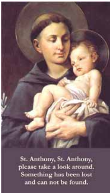
St. Anthony, St. Anthony, please take a look around. Something has been lost and can not be found.