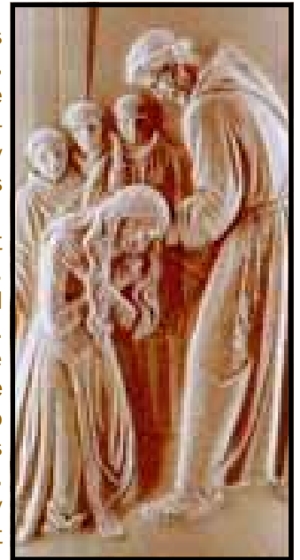
St. Francis crops the hair of his first female follower, St. Clare, a noblewoman who embraced holy poverty and was the first of the Poor Clares.

During the Lent of 1212, a new joy, great as it was unexpected, came to Francis. Clare, a young noblewoman of Assisi, moved by the saint's preaching at the church of St. George, sought him out, and begged to be allowed to embrace the new manner of life he had founded. By his advice, Clare, who was then but 18, secretly left her father's house on the night following Palm Sunday, and with two companions went to St. Mary of the Angels chapel, where the friars met her in procession, carrying lighted torches. Then Francis, having cut off her hair, clothed her in the friars' habit and thus received her to a life of poverty, penance, and seclusion. Clare stayed provisionally with some Benedictine nuns near Assisi, until Francis could provide a suitable retreat for her, and for St. Agnes, her sister, and the other pious maidens who had joined her. He eventually established them at St. Damian's, in a dwelling adjoining the chapel he had rebuilt with his own hands, which was now given to the saint by the Benedictines as a home for his spiritual daughters, and which thus became the first monastery of the Second Franciscan Order of Poor Ladies, now known as the Poor Clares. (To be continued...)