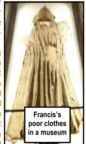
Francis's poor clothes in a museum

Francis was moved to take these words as spoken directly to himself, and as soon as Mass was over, he threw away what little he still possessed of the world's goods: his shoes, cloak, pilgrim staff, and empty wallet. At last, he cried out, he had found his Vocation! Having obtained a coarse woolen tunic, which were worn at that time by the poorest of the peasants in the Umbrian region, and tying it around