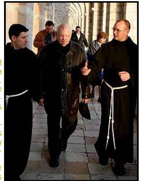
Mikhail Gorbachev during his visit to the Basilica of St. Francis in Assisi

(Sources: "La Stampa" of Turin, Italy and "Daily Telegraph" of London)